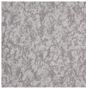
DURADECK FLINT GREY