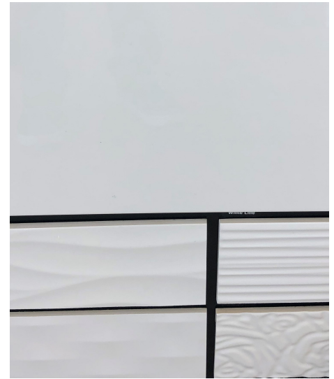
JULIAN WHITE TILES IN BATHROOMS