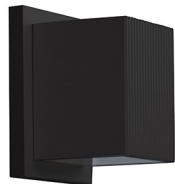
KUZCO EXTERIOR EW4405