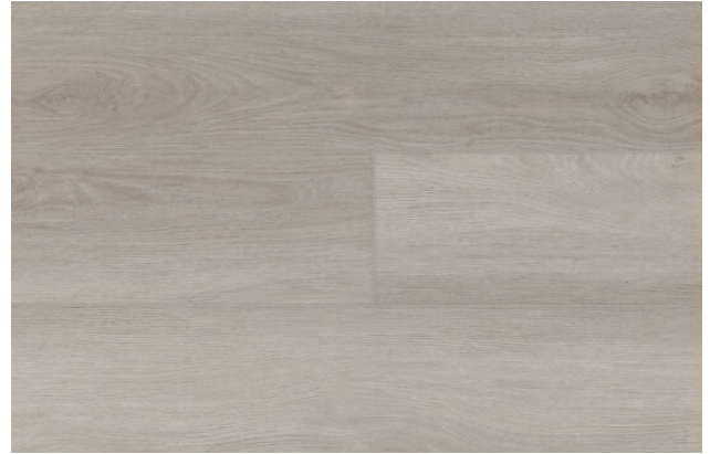
TORYLS HENDRIE VINYL FLOORING