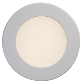
LITELINE RECESS LED 4" SLM4