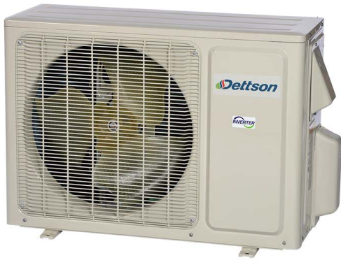
DETTSON ALIZE HEATPUMP MODEL: COND-09-01 MIDDLE UNITS MODEL: COND-12-01 END UNITS