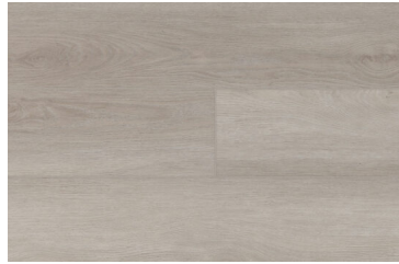
TORYLS HENDRIE VINYL FLOORING