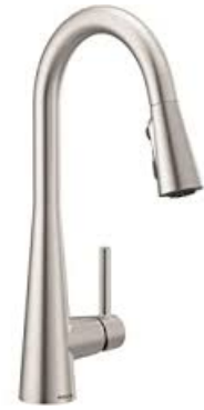
MOEN ALIGN KITCHEN FAUCET MODEL: 7565