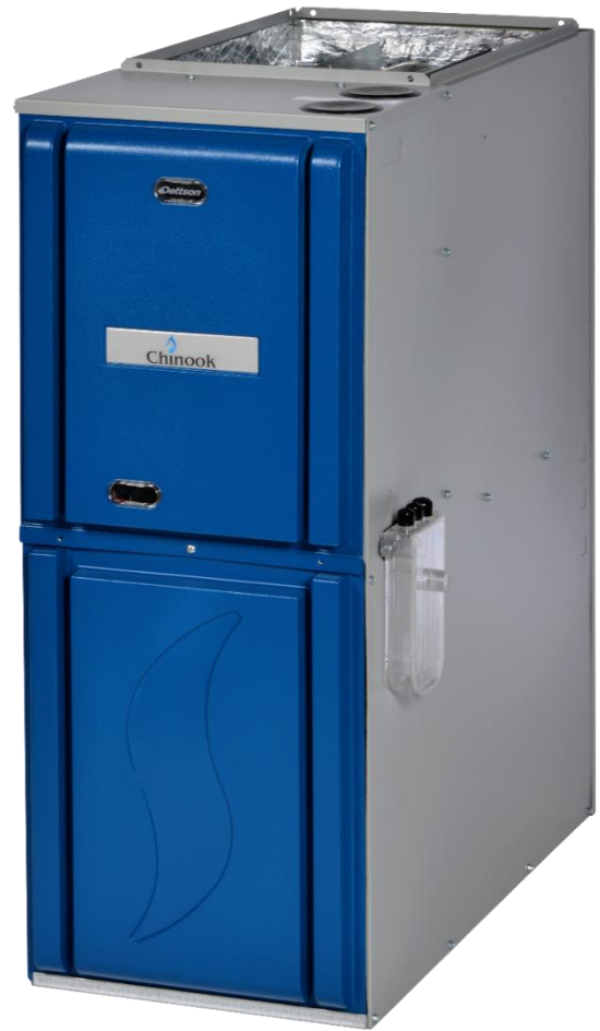
DETTSON CHINOOK GAS FURNACE MULTI-POSITION EFFICIENCY CONDENSING MODEL: CC15-M-V MIDDLE UNITS MODEL: C30-M-V END UNITS