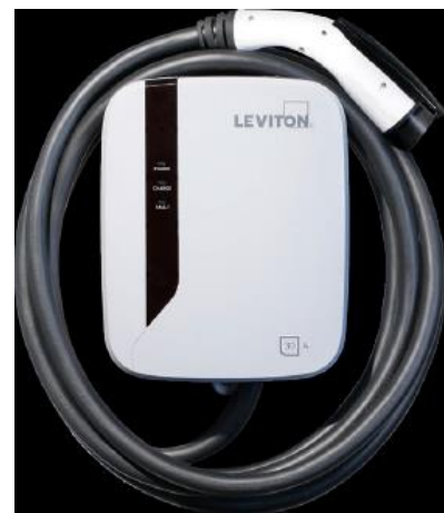
LEVITON VEHICLE ELECTRIC CHARGER Evr-Green® Level 2 EV Charging Stations