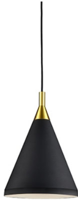
KUZCO DOROTHY 492710