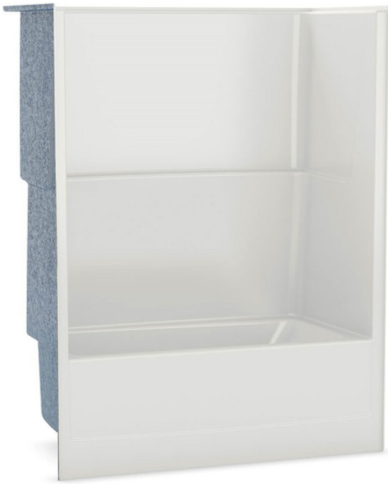
MAAX TSEA PLUS TUB/SHOWER MODEL: 105674