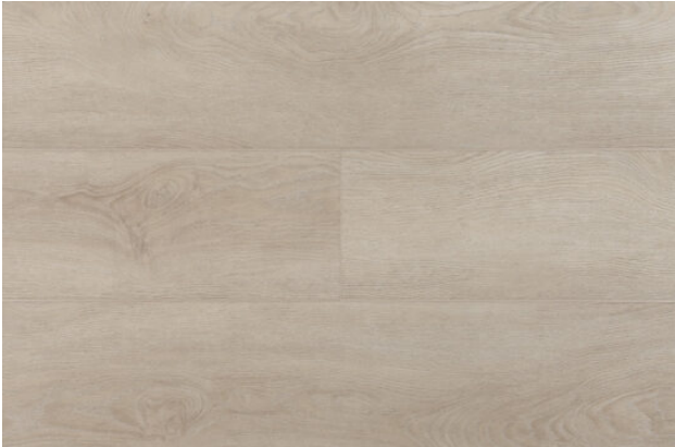
TORYLS LASALLE VINYL FLOORING