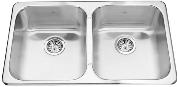
REGINOX KITCHEN SINK MODEL: RDU1831/7