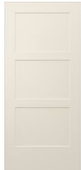
JELDWEN BIRKDALE INTERIOR DOORS