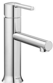
MOEN ARLYS BATHROOM FAUCET MODEL: 84770