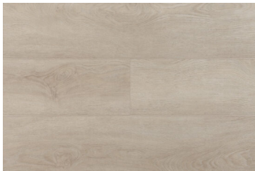
TORYLS LASALLE VINYL FLOORING