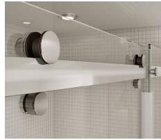
MAAX HALO SHOWER DOOR MODEL: 138997