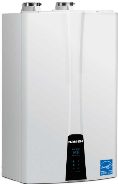
NAVIEN PREMIUM CONDENSING TANKLESS WATER HEATERS