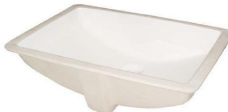
DUVAL BATHWORKS GRACE BATHROOM SINK MODEL:UL2014