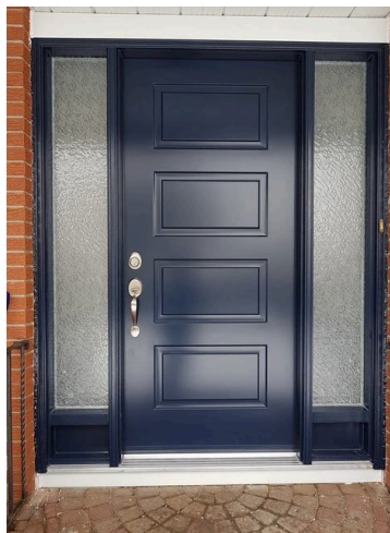
EUROSTAR EXTERIOR DOOR MODEL: 2501